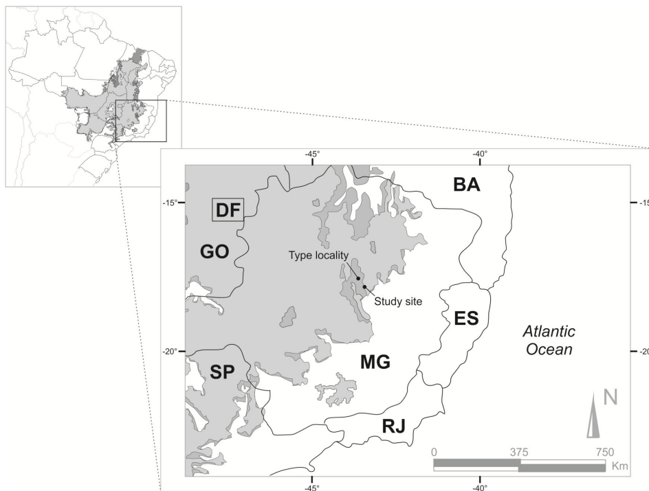
Figure 1. Map showing type locality of Calassomys apicalis at Parque Nacional das Sempre Vivas, Minas Gerais state, Brazil, and the location of our study site.

We collected two adult males of C. apicalis in a campo rupestre area (18° 11' S; 43° 34' W; elevation 1322 m a. s. l.) in southern portion of Espinhaço Mountain Range, northern Minas Gerais State, during two field traps in May and June 2016 (Figure 1). The climate is type Cwb, ac-