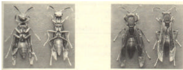
Figure 1. Dorsum (A) and ventral view (B) of female and male of Polistes ferreri .

The males of P. ferreri were smaller than the females and presented a darker coloration (Figure 1), which facilitated their discrimination. The number of segments of the antennae also was different between males and females.