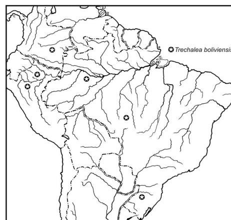
Figure 1. Map with the distribution of Trechalea boliviensis in Brazil.

Imbuia", Paraná (J. de Moura Leite) the occurrence of this species is recorded for the first time to some localities in Brazil, like, Amazonas, Mato Grosso, Paraná and Rio Grande do Sul (Fig. 1) and the geographical distribution is enlarged.