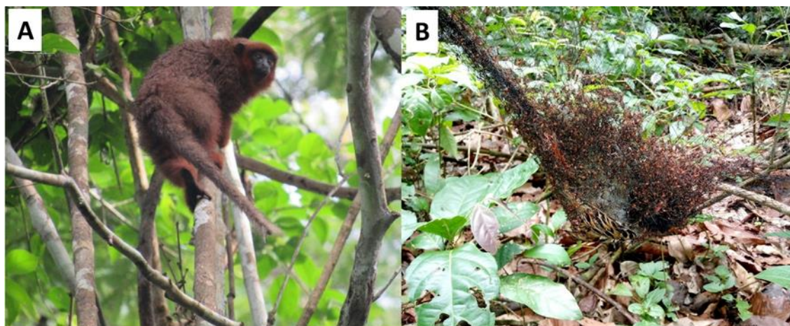
Figure 1. Predators of birds trapped in mist nets in the Humaitá Forest Reserve, Southwestern Amazonia. A: Toppin's titi monkey ( Plecturocebus toppini ). B: Army ants swarm ( Eciton burchellii ) preying on an individual of the Black-spotted Bare-eye ( Phlegopsis nigromaculata ).