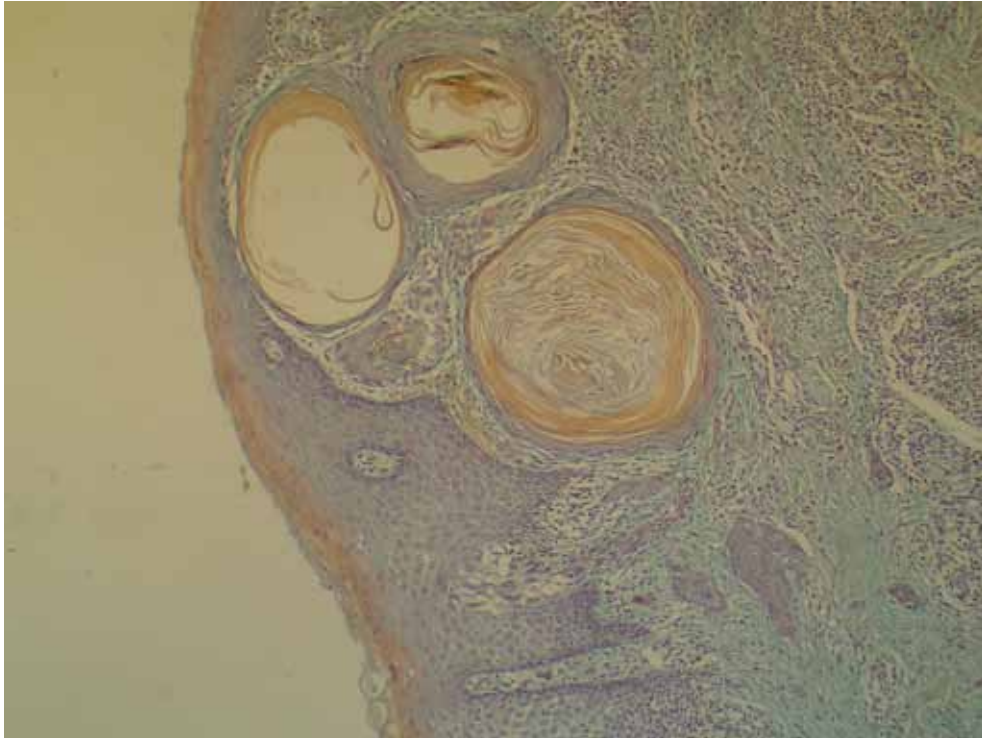
Figure 2: Panoramic view of the well-differentiated squamous cell carcinoma. Papanicolaou stain, 100x magnification.