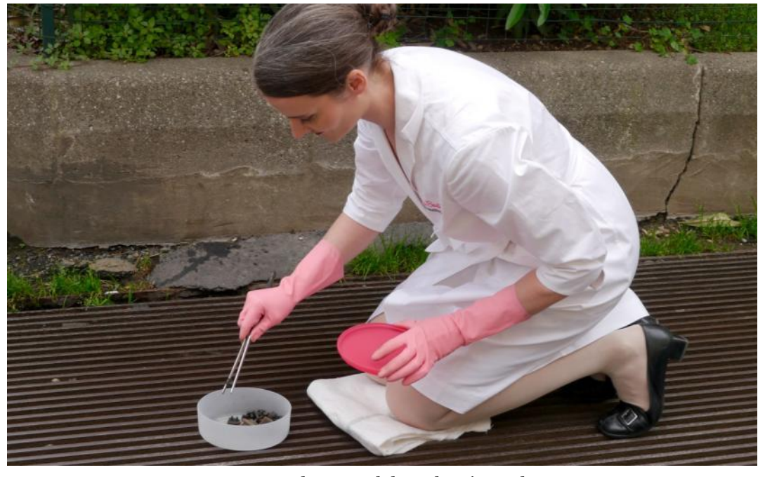
Figure 4 - Elke Reinhuber, 2013. The Urban Beautician. Heel Appeal, Milan, 2013.

At least during the day of the action, a spontaneous local audience became aware of the issue. Presenting the work as video abroad will hardly change anything for the ladies in Milan, though the piece points — understandable for everyone — to different needs which should not be neglected during design and construction processes. In my opinion, the initial photographs of the grates only became complete through the action itself and the subsequent video-documentation, as well as the performance relic, in the form of a box of the pulled-out rubber tips.