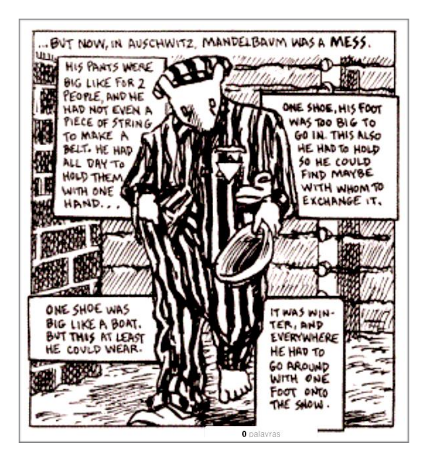
Figure 5: One of Most used representation on Maus: mice as Jews. Source: Art Spiegelman, Maus: a survivor's tale p.189, 2011 (b).

By representing Jews as mice, Spielgelman presents a version of these people not as human beings, but from the Nazi army's perspective in which Jews represent a type of plague that must be systematically controlled and eliminated. He attributes to this social group, as to himself, the entire pejorative semantic load the animal "mouse" has. Not by any coincident, Germans are represented by cats, emphasizing the predator relation between Nazi army and Jewish people. The repulse meaning of mouse is so strong that even those represented by rats bother with their presence, they feel fear, repulse and disgust by the animal, in this case the animal as we know.