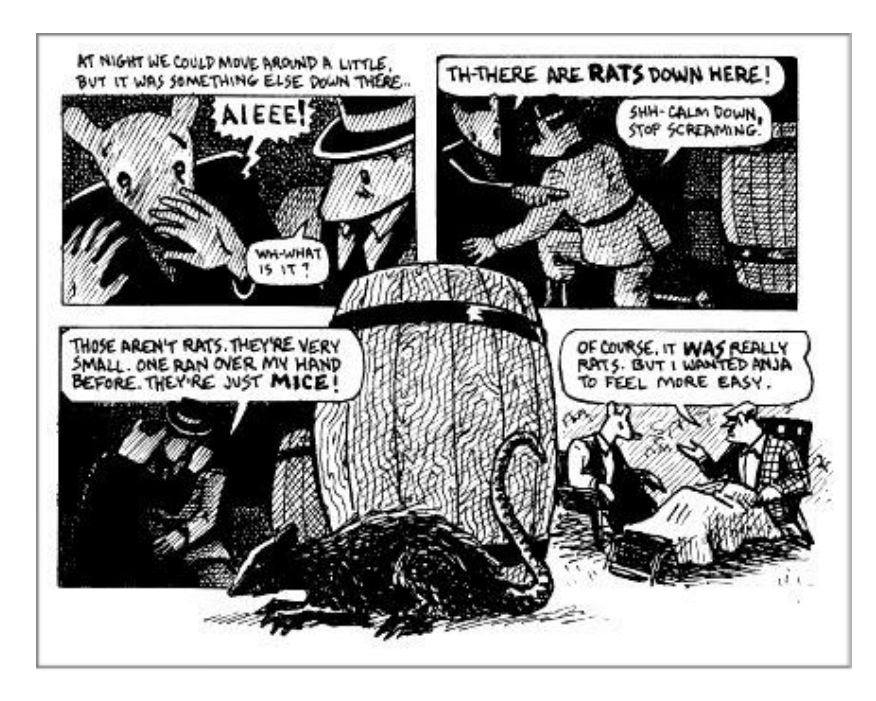
Figure 6: Art Spiegelman. Source: Maus: a survivor's tale p. 149, 2011 (b).

A reader, however unaware, would not take more than a few pages, perhaps frames, to realize that the story is about Vladek Spiegelman's experiences during the Jewish Holocaust (Shoah) and the parent-son relationship. It is a life story in which the author's identity is evidenced by a code established in the comic itself. The representation of himself as a mouse does not break the autobiographical theme, but, on the contrary, goes along with an intention to represent him, constructed from selections and choices.