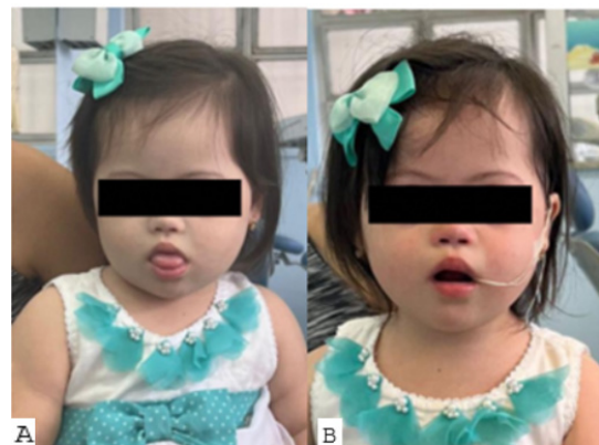
Figure 1: A- patient at rest without the PPM; B- patient at rest with the PPM.

Despite not adhering to the recommended PPM frequency, the mother noted improved tongue positioning and lip sealing in her daughter during therapy and expressed interest in continuing treatment.