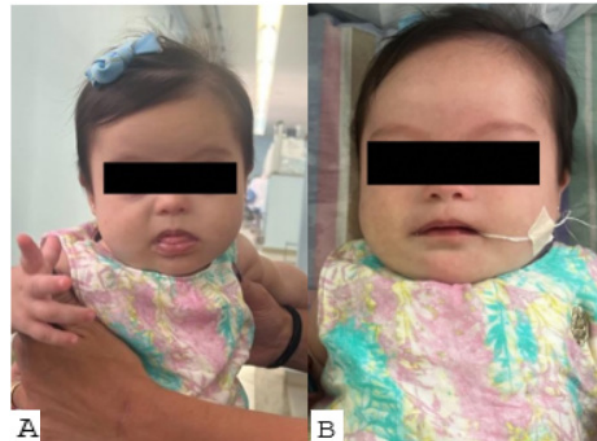
Figure 3: A- patient at rest without the PPM; B- patient at rest with the PPM.

This study aimed to evaluate the results of PPM use in two children with different situations: one with no erupted teeth and another with erupted teeth. Differentiating these scenarios was crucial to understand