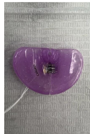
Figure 4: PPM.

the device's impact based on tooth eruption stage. However, significant challenges impacted treatment continuity and completion in both cases.